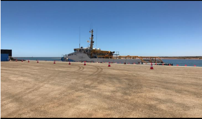
The Onslow Marine Support Base was NAIF's first Investment Decision and is set to reach financial close shortly